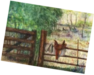
These are a few of Nyla's watercolors.