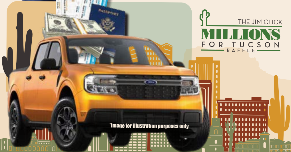
*Image for illustration purposes only

With your $25 contribution (or 5 tickets for $100) you could win this stunning vehicle or one of two other great prizes! The best part is that 100% of your contribution will support Southern Arizona charities that keep all the proceeds from the maximum 100,000 tickets which will be sold. The drawing will be held on December 15, 2022. Entries must be received by December 9, 2022 at Raffle Headquarters.